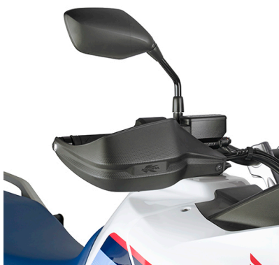
KHP1201B Specific, technopolymer, black hand protectors