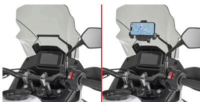
KFB1201 Fairing upper bracket to be mounted behind the windshield to install KS920M, KS920L, KS95KIT and GPS-Smartphone holder

For KS920M, KS920L, KS952B, KS953B, KS954B, KS955B, KS956B, KS957B, KS958B, KS95KIT / diameters 12 mm