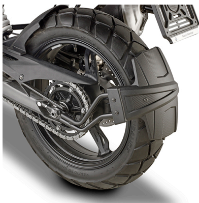
RM5126KITK Specific kit to install the spray guard KRM01, KRM02